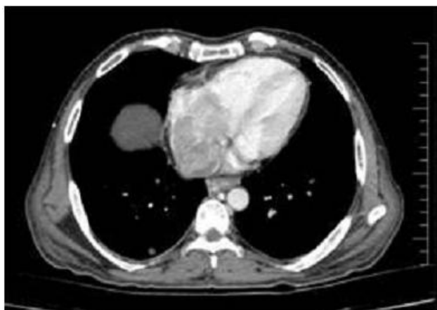
Fig 3: CECT thorax showing tumour thrombus in both the atrium.