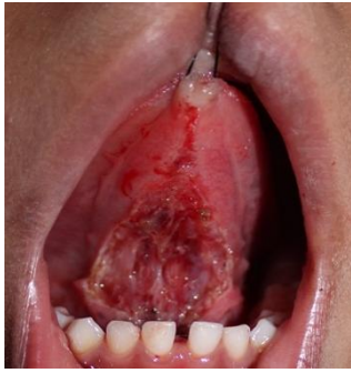
Fig 6 – Tissue after use at 810 nm wavelength of laser