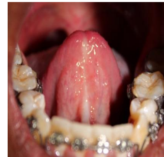
Fig 12 – Case 3 Post-op