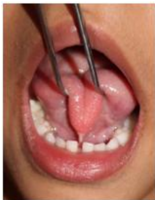
Fig 1 - Case 1 Attachment of lingual frenum at tip of tongue

Mobility of tongue increased significantly (Figure 8) along with improvement of speech. Patient was advised to undergo speech therapy for better speech articulation.