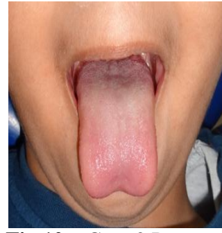
Fig 10 – Case 2 Post-op