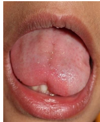
Fig 2 – Restriction of tongue movement