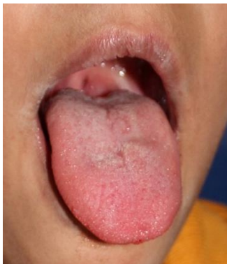
Fig 8 – Range of tongue movement at 6 months