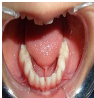
Fig 9 – Case 2 – Pre-op