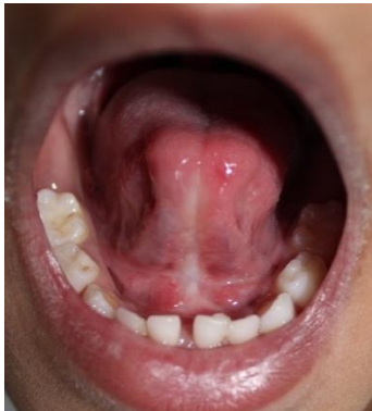
Fig 7 – Post op 6 months