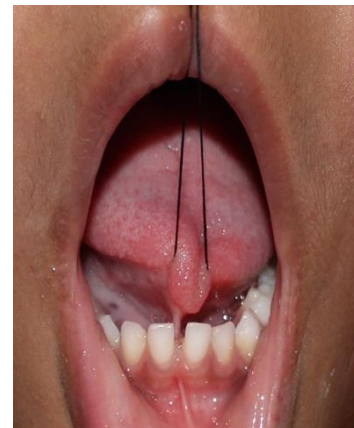
Fig 3 – Traction suture through tip of tongue