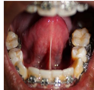
Fig 11 – Case 3 Pre-op