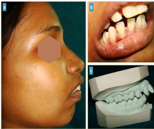
Figure 1: (A) Extra oral lateral view (B) ineffective anterior guidance (C) Diagnostic cast showing extent of overjet and overbite deformity

dentofacial deformity to understand the patient's conviction for the treatment. The patient was young and had been suffering from the impaired facial aesthetics as a result of skeletal deformity. Marriage could be a reason for motivating her to undergo a lengthy treatment protocol. The patient was thoroughly educated about her dental condition, especially the role of anterior teeth in developing the cuspal anatomy of posterior teeth. Future impacts of the present condition on the long term retention of teeth were, explained in detail to the patient.