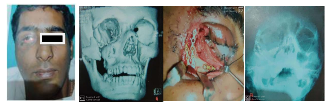
F 1-Displaced fracture of right zygoma, F 2- Grossly displaced comminuted fracture of right zygoma complex-oblique view, F 3- ORIF of right zygomatic fracture with mini-plates and screws. F 4- Waters view showing ORIF of right zygoma complex fracture.