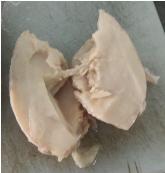
Fig. 1 Gross: Soft tissue mass, grey yellow, homogenous, devoid of whorling pattern

xanthoma/foamy histiocytes and occasional psammoma bodies. Fig 2