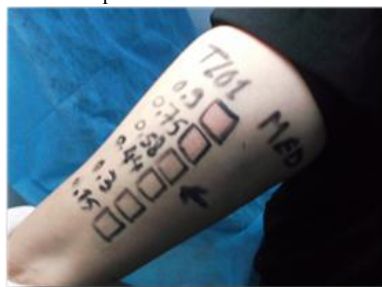
Figure (2): The tested site 24 hours later, the minimal erythema dose in this patient was assessed as 580mJ/cm 2 according to accompanied table (Table1)