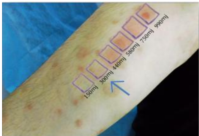
Figure (4): Psoriatic patient with MED to narrow band UVB at 300 mJ/cm 2 .