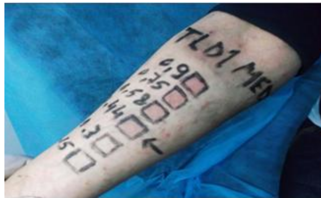
Figure (5): Eczema patient with MED of 440 mJ/cm 2 .