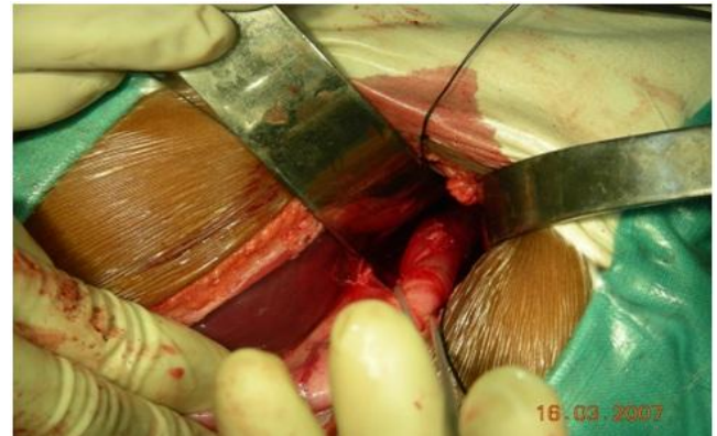
Figure 1: Mobilisation of intra-abdominal oesophagus

The intra-abdominal oesophagus was mobilized. Lower oesophagus was anchored to the esophageal hiatus. Restoration of the angle of HIS was done. Partial anterior plication was done and the fundus stitched to diaphragm. (Refer Figures 1 – 4). Post Op Evaluation was done by Barium meal study /Cine radiogram to ensure complete resolution of GER.