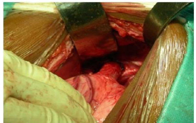
Figure 2 : Anchoring of intra-abdominal oesophagus to crura of diaphragm