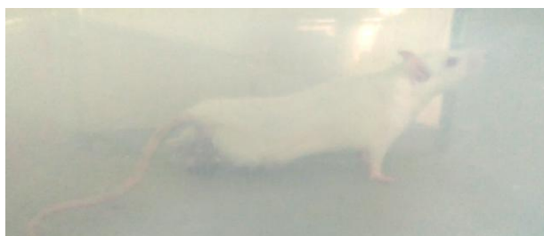
Figure: 3 Animal showing initiation of writh – stretching body & extension of hind limbs

Writhing is defined as a stretch, tension to one side, extension of hind legs, contraction of the abdomen so that the abdomen of rat touches the floor, turning or twisting the trunk. The animals did not always give full writhing, sometimes they started to give but they did not complete it. This unfinished writh was counted as half-writhing. Hence, two half writhes were taken as one complete writhing.