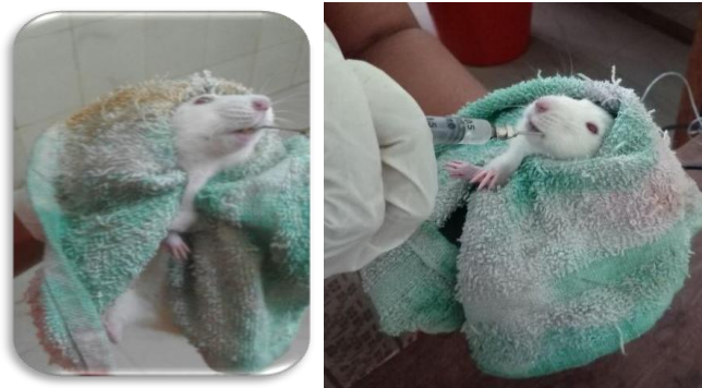
Fig: 1 & 2 Handling & Administration of test drug to rat using oral gavage

The animals were divided into 5 groups comprising 6 rats in each group. Group A (Control) received normal saline at a dose of 2ml/200g b.wt. Group B (Standard) received standard drug Mefenamic acid 9mg/200g b.wt. Test groups received half the calculated effective dose(TG1), calculated dose(TG2) and double the calculated dose(TG3) of the test drug. Drug were done as a single dose through oral route.