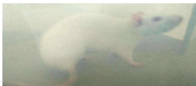
Figure: 4 Animal showing completion of writh – twisting the trunk