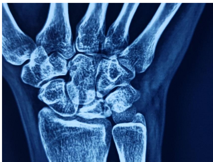
Figure 1: AP view of wrist xray showing Kienbock's Disease of lunate

Arthroscopy allows direct visualization of diseased bone with minimal morbidity. Drilling of lunate works on same principles similar to those involved in avascular necrosis of femoral head theoretically enhancing the blood supply. The present case report is unique as the disease was diagnosed arthroscopically and the drilling of lunate was done the help of arthroscope under vision.