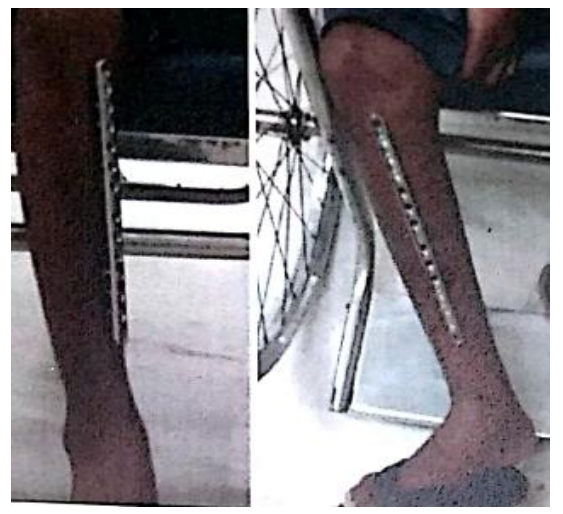
Fig.2 Clinical picture with plates in situ

Toe touch walking and partial weight bearing were allowed as tolerated by the patient from the first postoperative day<sup>[13]</sup>. Active knee and ankle ROM exercises were included in rehabilitation. Walking was delayed for 3 months in patient with contralateral lower limb injury.