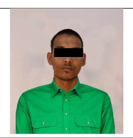
Fig-9 Pre-op and Post-op