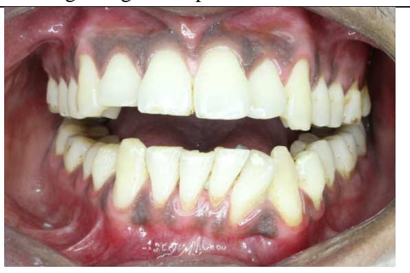
Fig-4 Maxillary inclination