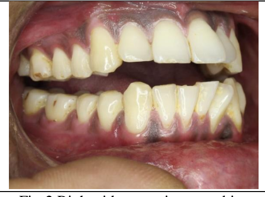
Fig-2 Right side posterior cross bite