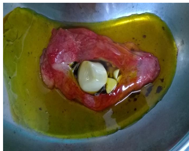
Photograph of Operated Gall bladder containing stones: