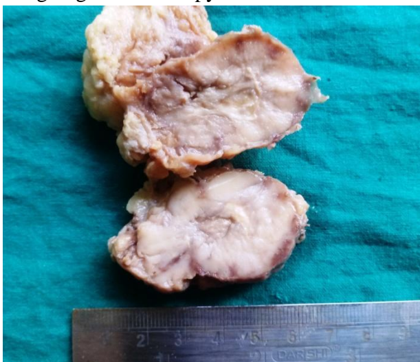
Image 1- Breast lump showing fleshy cut surface.

Based on the diagnosis, mastectomy was not considered necessary and the patient is currently undergoing chemotherapy.