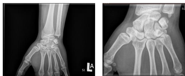
Figure 3. Wrist radiographs (PA projection) of a volunteer with 2 different collimation

radiographs. The following are the comparison of radiographs resulting from smaller and larger collimation.