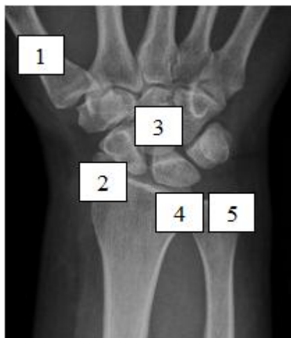
Figure 1 List of measuring ROI point SNR

List of point Region of Interest (ROI) measurement SNR at Radiant DICOM viewer: