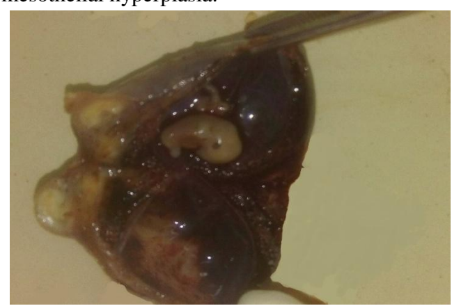
Fig. 1 Gross photograph showing dilated fallopian tube with an embryo.

Sections of the tube medial to the site of EP showed dense and diffuse infiltration of the wall and plicae by lymphocytes and plasma cells in 36 cases. Variable number of mast cells were also seen. The inflammatory infiltrate extended to the parametrium and serosa thus constituting pelvic inflammatory disease (PID). In 5 out of these 36 cases there was plical fusion dividing the tubal lumen into multiple epithelium lined channels – follicular salpingitis (Fig. 3). Five cases showed mesothelial hyperplasia.