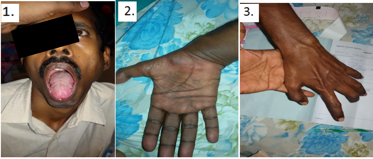
Fig 1,2,3 – Wasting of tongue and hands

including full movement of spine. Other system examination does not reveal any abnormality. Investigations revealed normal routine blood results.BRE, RFT, LFT, RBS, FBS, PPBS, HBA1C, VDRL and viral markers was normal. Peripheral smear-normal TFT, PTH, S. Electrophoresis, Ach and Musk Antibody, S.calcium, S.phosphorous - normal. Serum immunoglobulin -normal Creatine kinase (CK) level was normal ANA including ANA profile -negative MRI spine with brain screening was normal Nerve conduction studies (NCV) showed low amplitude median and ulnar compound muscle action potentials (CMAP).