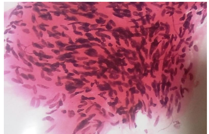
FNA Smear-Leiomyoma benign smooth muscle cell with blunt ended bland looking nuclei.