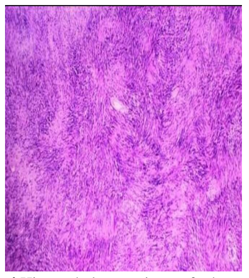
Figure 4 Histopatholgy specimen of schwannoma