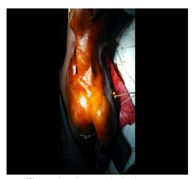
Figure 1.Left supraclavicular mass

Postoperatively patient improvement was uneventful. The symptoms of patient improved gradually. On follow up of patient for 2 years duration is asymptomatic with no complications.