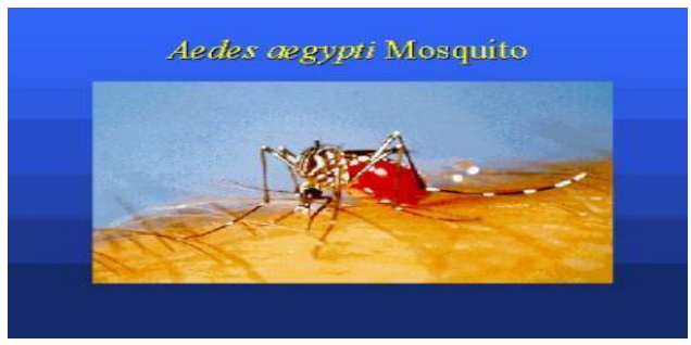
Aedesaegypti mosquito. Picture from the Centers for Disease Control and Prevention (CDC) Web site.