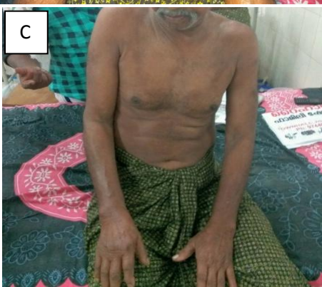
Fig.1 A edema and movement limitation of right hand.

B edema of both hands and wrist (dorsal aspect)