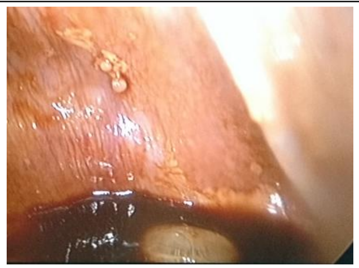
Fig 3. Intra operative image showing the daughter cyst