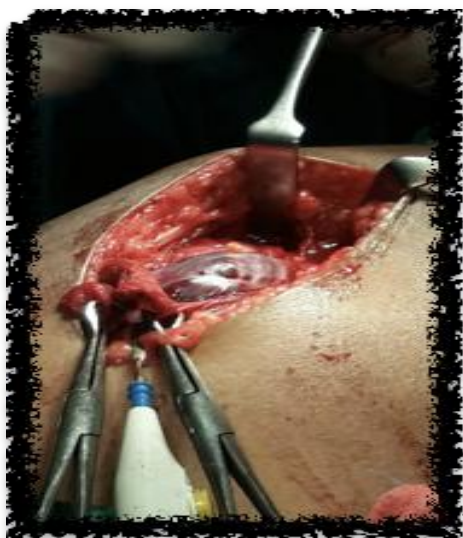
Fig.4 & 5 Showing the surface of tumor arising from the nerve sheath