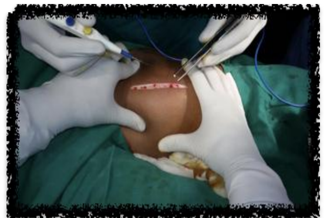
Fig.3 Image showing the dissection of tumor