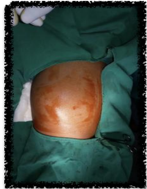
Fig.1 Preoperative Image Show The Well Circumscribed Tumor