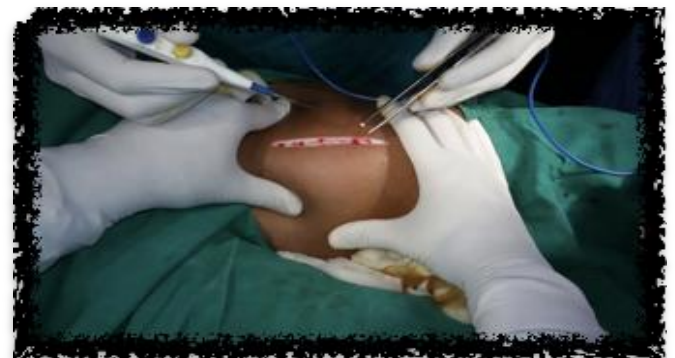
Fig.2 Linear incision being taken over the tumor