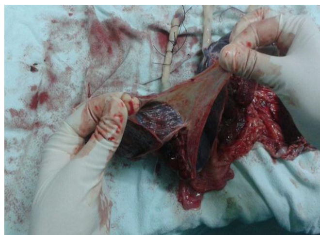
Figure 2- Quadrichorionic quadriamniotic placenta