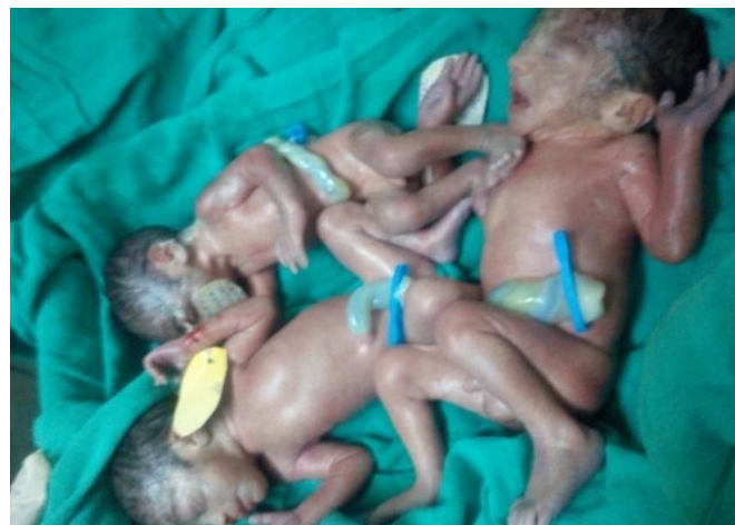
Figure 1- Three live babies of quadruplet pregnancy (two male and one female)

to Neonatal Intensive Care Unit and discharged after 4 days) and one male dead fetus [Fig-1]. The birth weight of the two male and one female baby were 1700 gm, 1500 gm and 1350 gm respectively. The male still born weighed 900 gm. Placenta was found to be quadrichorionic quadriamniotic [Fig-2,3]. Intra operative and postoperative period were uneventful. Patient was discharged from hospital with three live babies on seventh postoperative day.