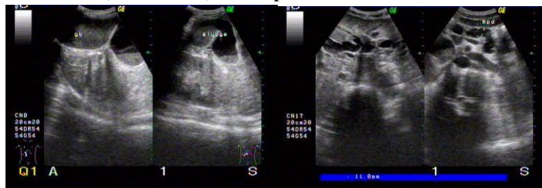
Fig 2 (a)