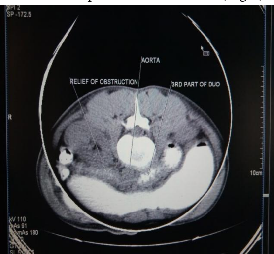
Fig 3. Prone CT scan showing passage of oral contrast beyond 3<sup>rd</sup> part of duodenum

On prone positioning, oral contrast was seen to pass beyond the site of previous obstruction (Fig 3).