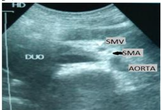
Fig 1. Ultrasound of the abdomen showing abrupt tapering of duodenal loop proximal to apparent compression between SMA and Aorta.

Ultrasound examination revealed distension of the stomach and dilated duodenum upto its second part with abrupt distal tapering and apparent compression of the third part of duodenum between the anteriorly located superior mesenteric artery and the aorta posteriorly. Beyond this bowel segment, the small bowel loops were collapsed. Aortomesenteric distance was measured to be 5 to 6 mm (Fig 1).