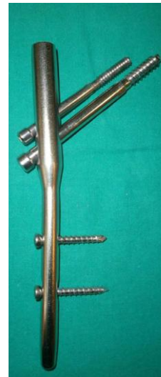
Trochanteric Fixation nail.