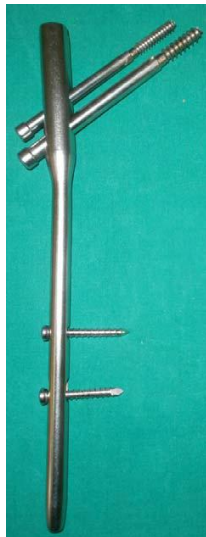
Proximal Femoral nail

bearing with a walker for a period of six to eight weeks. Patients were allowed full weight bearing after radiological evidence of fracture union. Radiographs were taken at regular intervals and evaluated for fracture healing alignment, screw breakage or screw back-out, cut-out, Varus malunion collapse. Clinical union was defined as a painless fracture site during full weight bearing. Radiographic union was defined as bridging trabeculations across the fracture line on two orthogonal views in the absence of migration, loosening or breakage of hardware. Cases were followed up until eighteen months. Functional assessment of patients was done using Modified Harris Hip Scoring system.