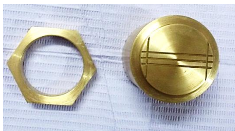
Fig. (1): A Metal die for making test specimens to evaluate dimensional changes.

2.2.2 Tear strength test: Specimens were made 90-degree angle – shaped free of nicks with a thickness of 1.8 mm according to the ASTM 1004 (10) . After disinfection they were loaded in tension until failure at a rate of 51 mm/min with a universal testing machine (USA Model No 942D 10-20) (fig.2).