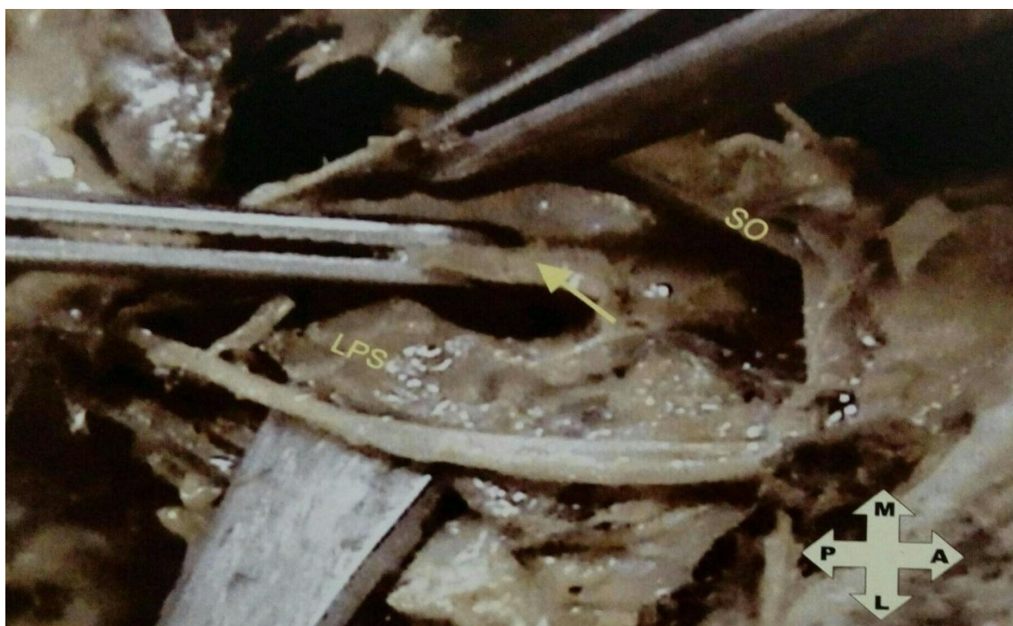
Figure 2. Illustration showing the muscular slip (arrow) between the Levator palpebrae superioris(LPS) and Superior oblique (SO) in right eye.