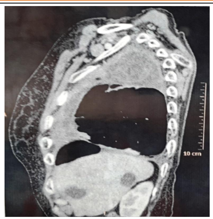
Figure 3: Sagittal view of computed tomography of thorax showing right sided apical effusion and incidental finding of liver abscesses.