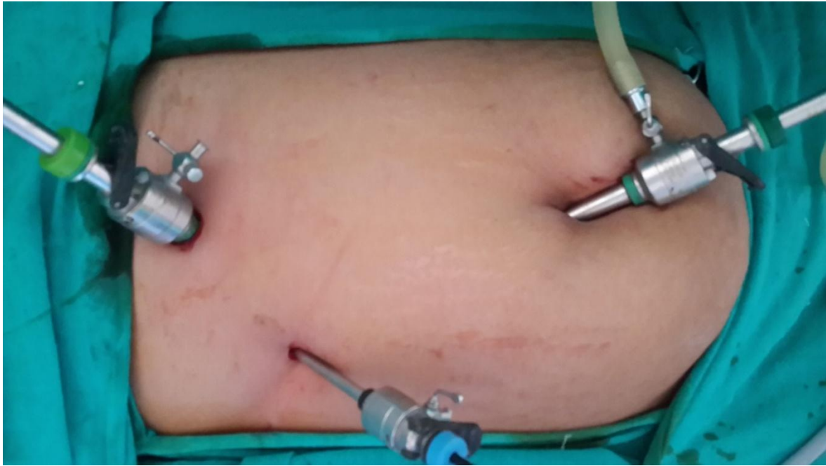
Figure 1. 3-port positions .