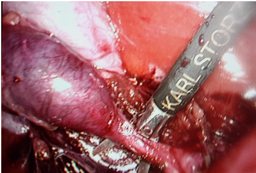
Figure 2 : cystic duct completely dissected in calots triangle.