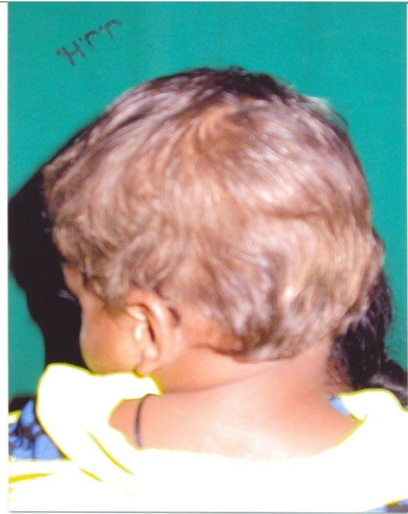
Fig 1 Case I showing hypopigmented hair.

Karyotype of both cases revealed normal chromosomal complement i.e 46XY and 46XX respectively (fig 3&4).