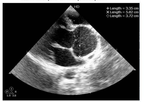
c. Aortic diameter showing dilated aorta