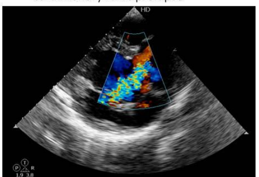
D: color doppler showing severe AR

The natural history of aortic dilatation in Marfan syndrome. Med J Aust. 1993 Apr 19;158(8):558-62.