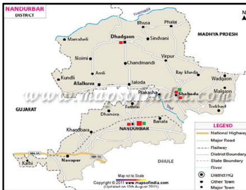
Figure-3: Distribution of clinically suspected MDR-TB cases & MDR-TB cases confirmed by GeneXpert® MTB/RIF in Nandurbar district