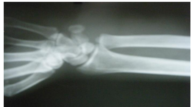
Fig.2 Radiograph of the right wrist joint showing no bony involvement.