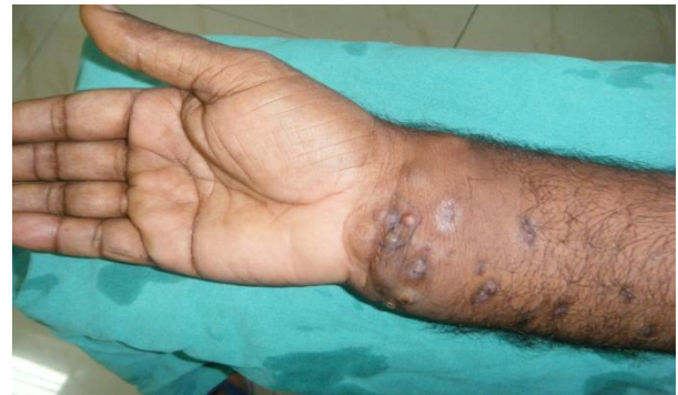
Fig. 1 Photograph of lesion.

revealed bits of fibrous connective tissue with a tract covered by granulation tissue, which focally showed a pale blue colony with surrounding Splendor -Hoepli reaction and numerous acute on chronic inflammatory cells suggestive of mycetoma (Figure 3). Gram stain was performed on tissue section and found positive whereas AFB turned out to be negative.