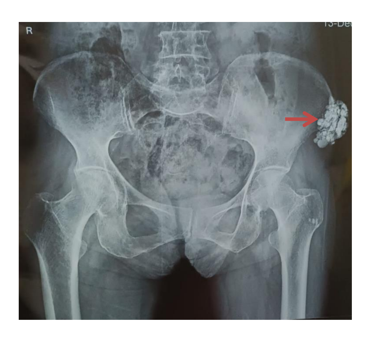
Figure 1: X-ray of pelvis showing the lesion of tumoral calcinosis. Chalky white lobulated appearance of the lesion is seen (red arrow). Size of tumor mass was 3\times2\times2 cms.

A seventy-year-old lady had a painless hard swelling in soft tissuesinvolvingleft sacroiliac joint. Swelling measured 3\times2\times2 cms approximately (figure 1).