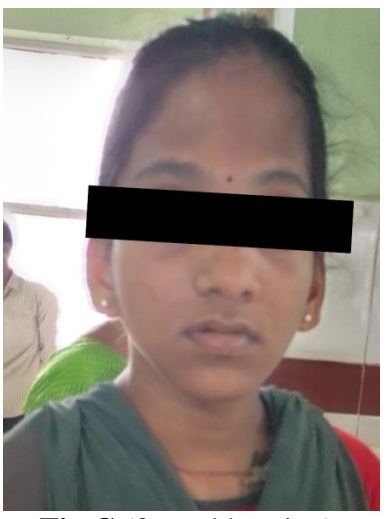
Fig C (frontal bossing)

A physical examination upon admission revealed that there were no limb length discrepancy, fusiform swelling of phalanges and clubbing which were tender on palpation without erythema. Range of motion were with normal limits and there was also mild tenderness along bilateral foot which she did not complaint of in the presenting complaints.