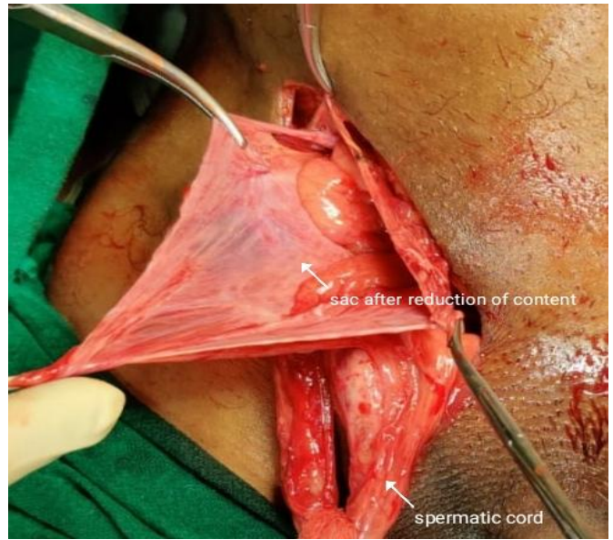
Figure 4 – intra op photograph showing hernial sac after reduction of content into peritoneal cavity

Hernial content (sigmoid colon) reduced into the peritoneal cavity [figure-4].