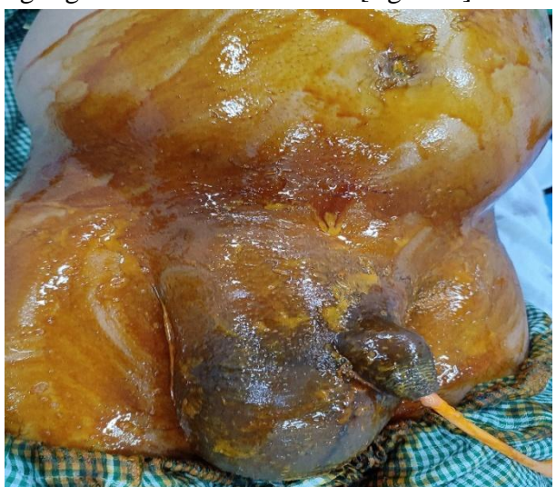
Figure 1 – local examination showing complete inguinal hernia reaching up to root of scrotum

45 years old male patient presented in the emergency department at DRPGMC Tanda with complaints of irreducible swelling in the right inguinal region for 24 hours. Swelling was associated with dragging pain in right inguinal region. Patient was a known case of right inguinal hernia for last 3 years but previously hernia used to appear only on coughing, sneezing and after doing heavy exercises. Patient had history of left sided inguinal hernia repair 5 years back. On abdominal examination, patient's abdomen was soft, non-tender, bowel sounds were present. In the right inguinal region, there was a large irreducible swelling reaching up to the root of scrotum, non-tender on palpation and it had feeble gurgling sounds on auscultation [figure-1].