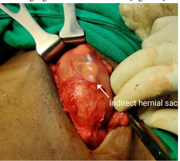
Figure 2 – photograph showing indirect hernial sac after opening sheath

Chest x-ray was normal. They were no evidence of air fluid levels on x-ray abdomen. Ultrasound Abdomen showed the hernial sac containing bowel loops with reduced peristalsis. The patient was diagnosed with right irreducible, complete inguinal hernia and planned for emergency surgery in view of bowel loops as content as there are chances of obstruction and strangulation. Intraoperatively indirect hernial sac was present containing sigmoid colon as content [figure-2].