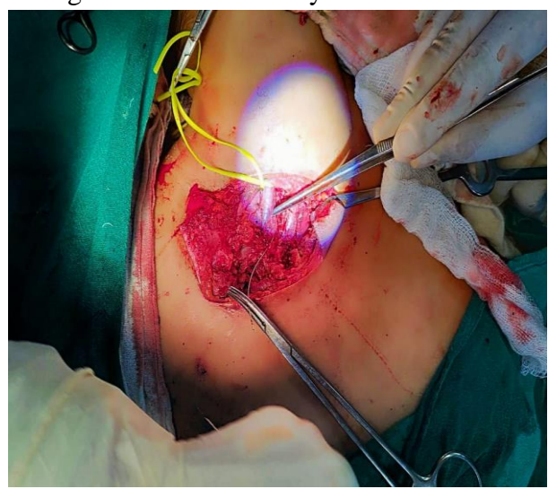
Figure 2: Intraoperative dissection

Patient started to desaturate and portable chest Xray revealed retained guidewire coiled around clavicle and right sided Pneumothorax for which ICD was inserted and subsequent chest x-rays showed improvement. After stabilization of vitals, surgery was planned and patient was taken for emergency OT in view of retained guide wire around clavicle and soft tissue. Surgery planned under general anaesthesia using lung protective ventilation. CTVS and ENT surgeon planned neck dissection to remove the coiled guidewire along with clavicle segment using infraclavicular approach. Patient extubated successfully and shifted to ICU for further management; where patient remained stable and after resolution of pneumothorax, ICD was removed. Patient was discharged after full recovery.