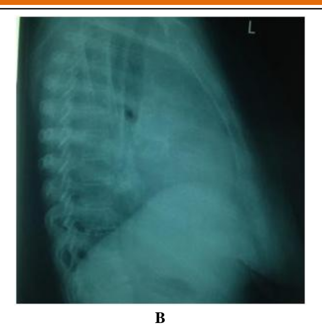
Figure 01: Chest radiograph PA (A) and lateral (B): homogeneously opacified left hemithorax.

The Contrast enhanced CT chest demonstrated a large soft tissue density (40- 50 HU) mass lesion occupying whole of left hemi thorax with significant contrast enhancement. Left main bronchus appeared to be completely cut off with total collapse of left lung (Fig. 2). The mass lesion showed homogeneous density with no necrosis or calcifications. The mass infiltrated down to the abdominal cavity via left diaphragmatic crus. However, there was no evidence of compression or infiltration of the distal oesophagus. A pleural effusion was not evident on CT thorax too. There were multiple enlarged lymph nodes in the mediastinum and left axilla with short axis diameter more than 10 mm. Ill-defined hypodense foci were seen in the left lobe of liver, the largest one measured at 1.5 x 2.1 cm in size which was later proved to be metastasis on liver biopsy. Rest of the abdominal organs were unremarkable and there were no bone metastasis.