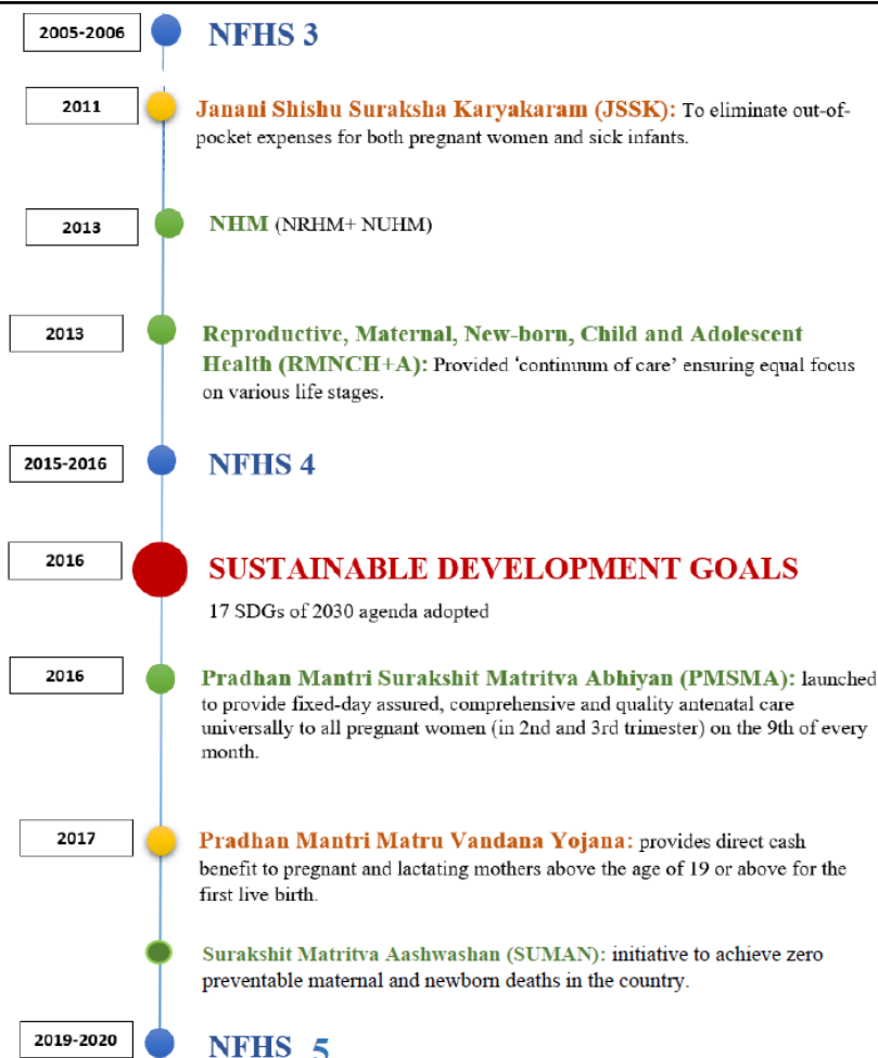
Figure 2: Timeline of maternal health care programs from NFHS-3 to NFHS-5