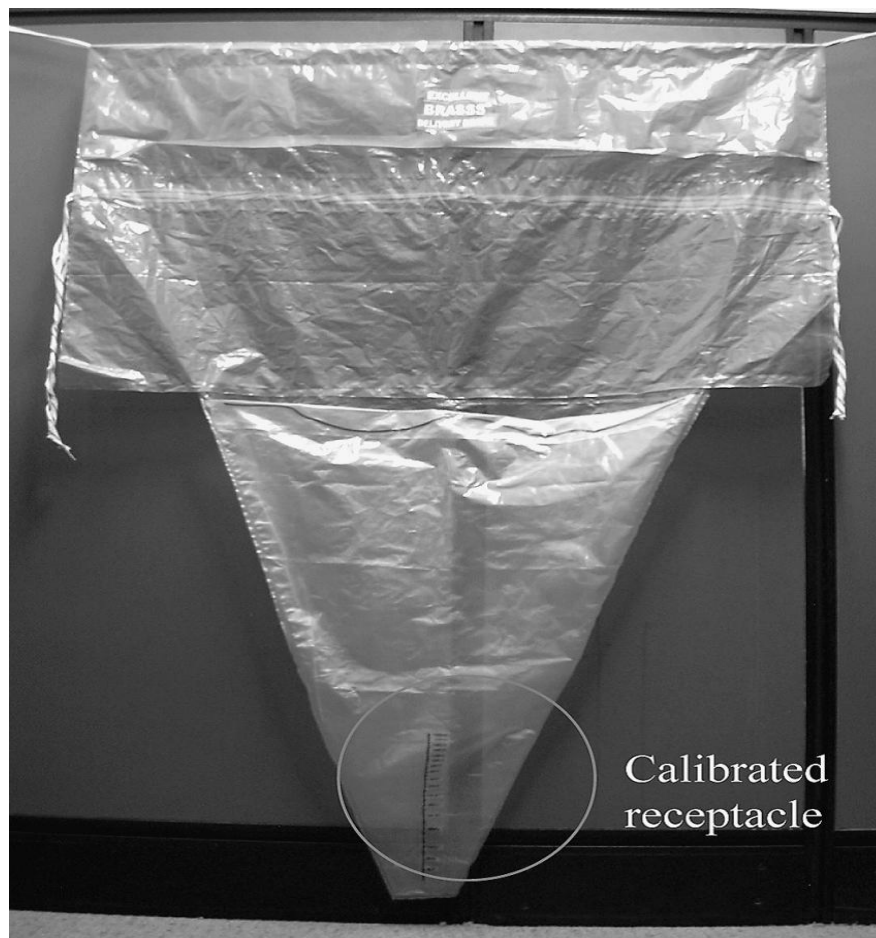
Figure I: BRASSS-V blood collection drape with Calibrated receptacle