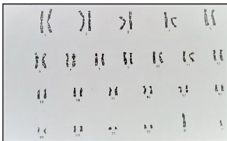
Figure 2: The Giemsa banding from peripheral blood lymphocytes of the infant showing normal male 46, XY karyotype.

A normal healthy baby was delivered at 36 weeks and 2 days. Further, the NGS and blood karyotype of the baby (Figure: 2 and 3) showed perfectly normal chromosomes without any aneuploidy or mosaicism.