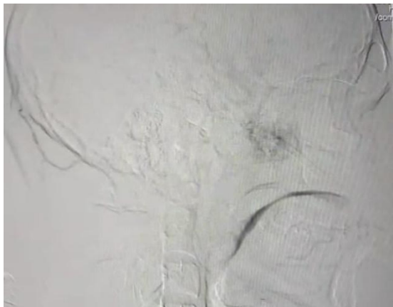
Figure 2: Angiogram showing pre and post embolisation of tumour using PVA foam

Endonasal Endoscopic surgery with preoperative embolisation is fast becoming the choice of approach by ENT surgeons worldwide. It is because of the magnified view of surgical field it provides, better control of bleeding and complete clearance of tumor thereby reducing the recurrence rate (15,16,17) . Other benefits include reduced surgical time and hospitalization, no external scars and complications like trismus, watering of eyes and facial deformity can be avoided (18) .