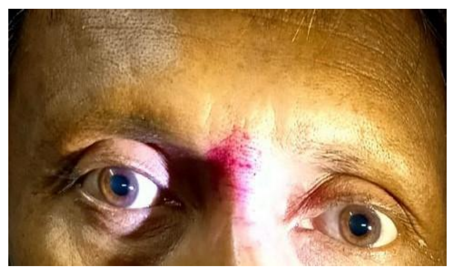
Mid Dilated Non Reactive Pupils in Right Eye and Left Eye

After 3 months visual acuity improved to counting fingers 4metres in RE and counting fingers 3 metres in LE.