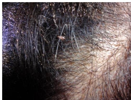
Figure 2: Lice and nits on scalp.