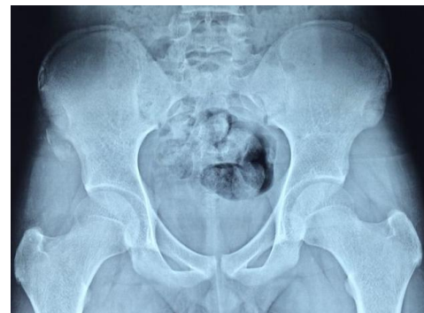
Figure 2: Plain radiograph of pelvis with both hip showing Right ASIS Avulsion fracture

After 6 weeks the hyosthesia had disappeared and the pateint was advised weight bearing and hip range of motion exercises. At weeks the patient was back to playing soccer with no functional deficit.