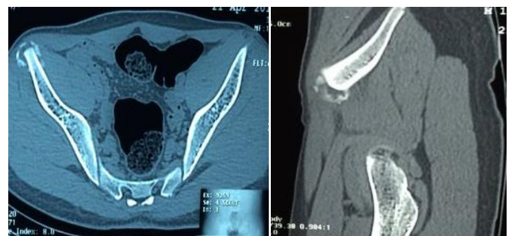
Figure 3: CT Scan