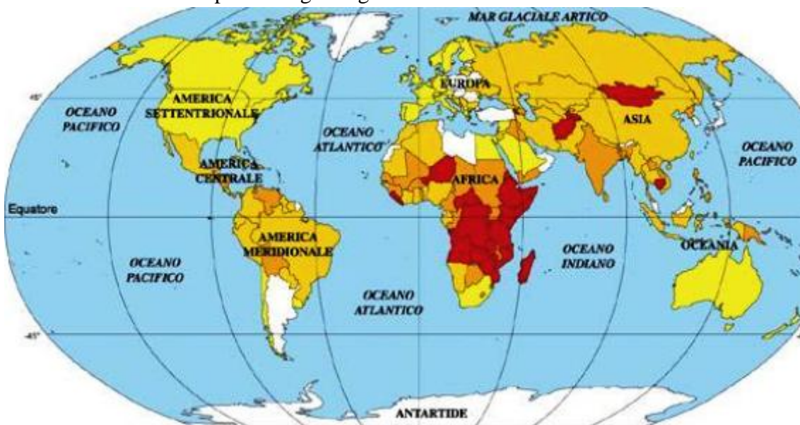
{ Map of education environments in 21 st Century of global economy by knowledge-power }

vis-à-vis development- ending whereas the right maturity for a civilization shall be continuous development whose limit tends from zero to infinity and hence achievable only with the means of UGC bidding farewell to plural currencies rehabilitation mechanisms all over the World and heralding monetary globalization . In other words, the two sides of the same coin – UGC and monetary globalization alone can rectify in the first place the two-model or the twin-problem of developing and developed economies right now in the 21 st Century A.D World (see map below)