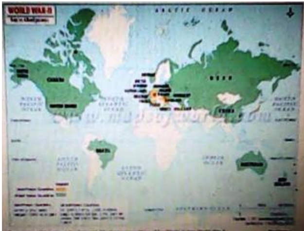
>>> 2 nd World War [Allies(green) vs Axis Powers ( orange)]

vanquishing yet a new unity of 3: Germany , Italy & Japan) such as lack of liberal economic cooperation , monetary globalization vide UGC in Law & Practice and affordable scientific and technological core knowledge applications for daily inputs of Agriculture (Seed and Fertilizer) & Industry (modern Technology and Power ) in many parts of the Globe .