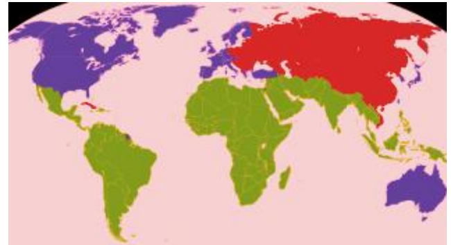
>>>> 1 st , 2 nd & 3 rd Worlds during the Cold War

Globe indicating immense human reproductive capacity as the sole available capital untouched by the two world wars and regional military conflicts.