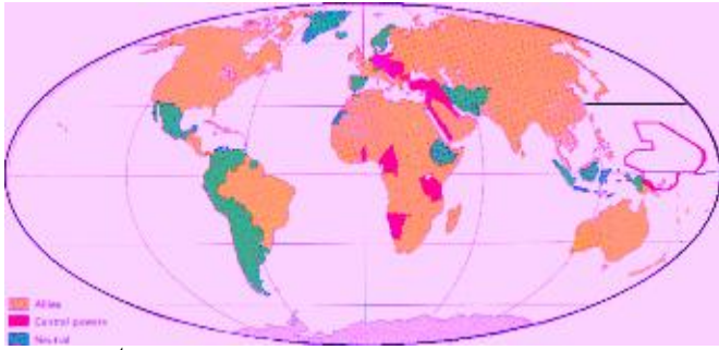
>>>1 st World War [Allies (orange) vs Central Powers (red)] .

vanquishing yet a new unity of 3: Germany , Italy & Japan) such as lack of liberal economic cooperation , monetary globalization vide UGC in Law & Practice and affordable scientific and technological core knowledge applications for daily inputs of Agriculture (Seed and Fertilizer) & Industry (modern Technology and Power ) in many parts of the Globe .